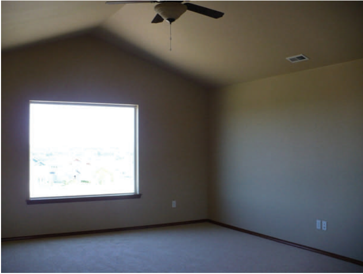
UPSTAIRS SPACIOUS BONUS ROOM