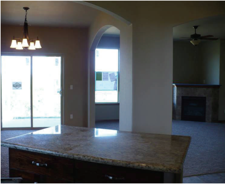
KITCHEN TO GREAT ROOM