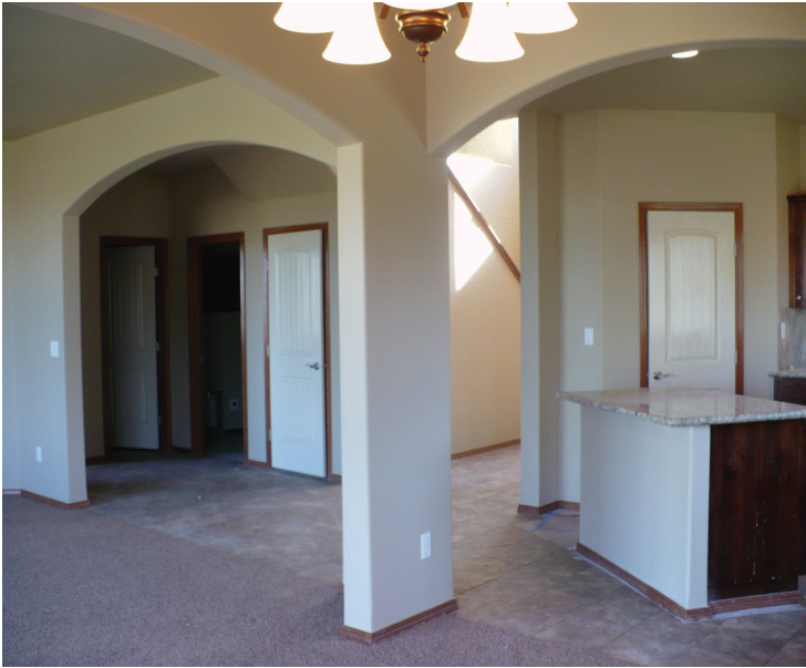
DINING OUT TO KITCHEN/ENTRY/LIVING