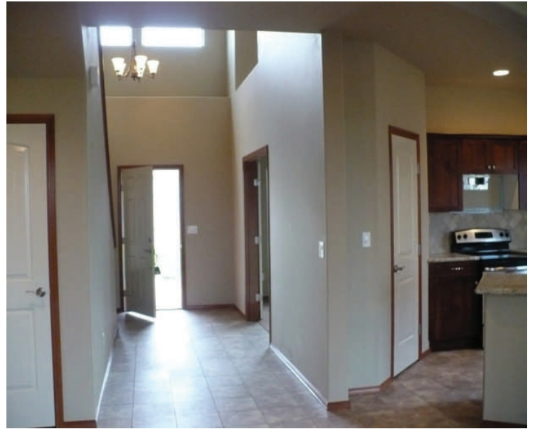
GREAT ROOM OUT TO ENTRY