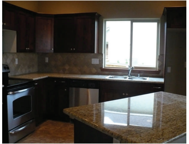
KITCHEN w/ GRANITE SLAB