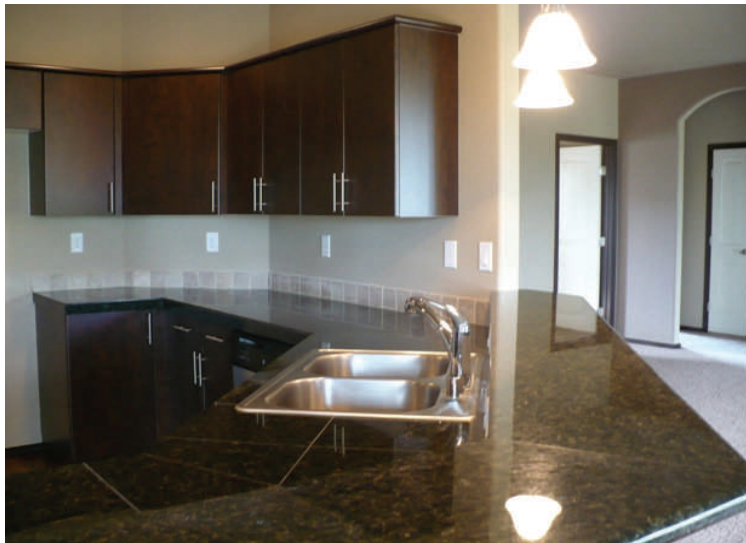
GRAINTE TILE/SLAB KITCHEN COUNTERS