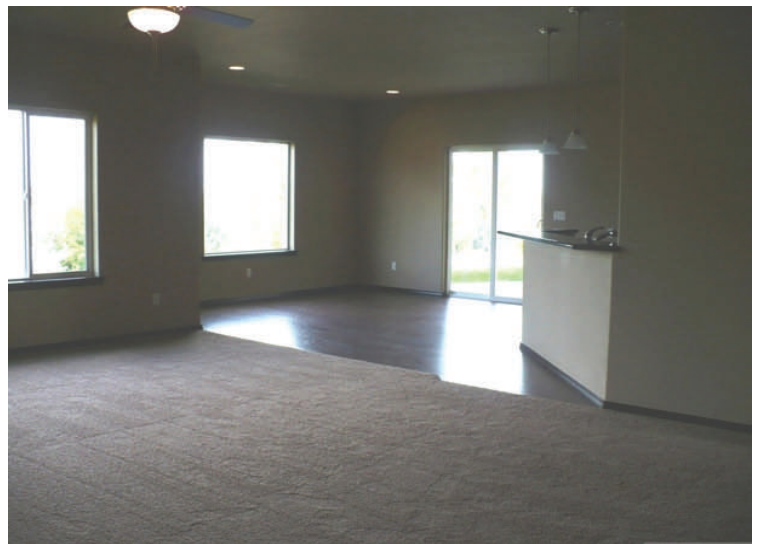
GREAT ROOM INTO DINING