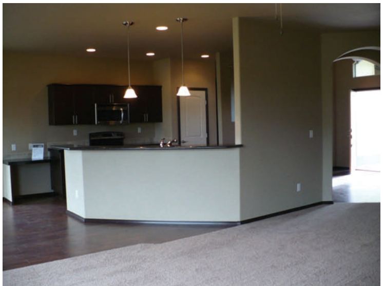
GREAT ROOM INTO KITCHEN